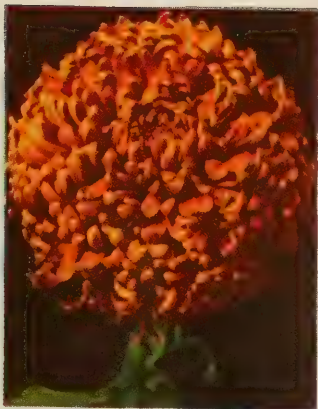
HILDA H. BERGEN 50c each; 3 for $1.25